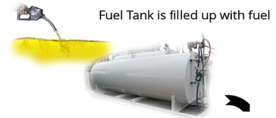
Fuel Tank is filled up with fuel