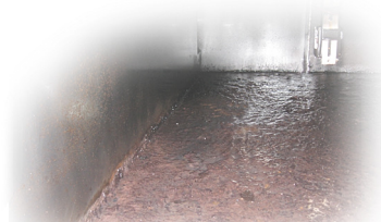
Water mixes with fuel and produces bacteria, sediment and water emulsifies in fuel