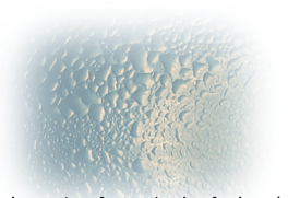
Condensation forms in the fuel tank